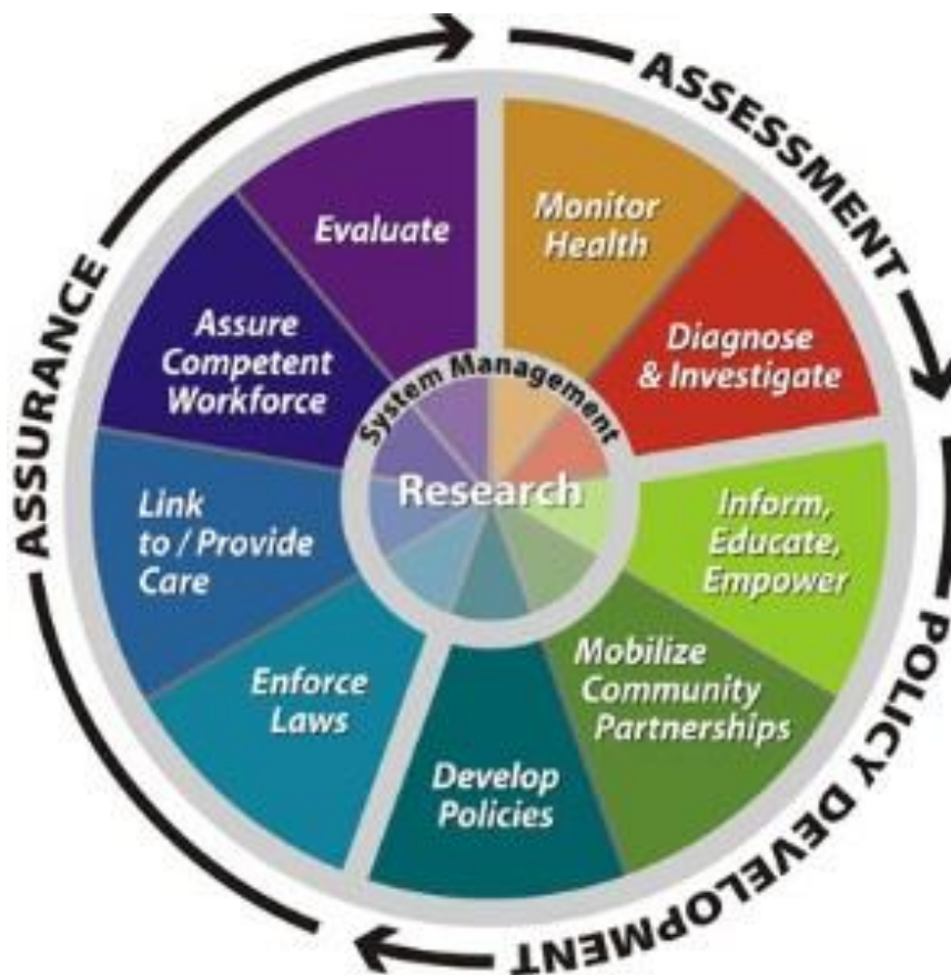
Figure 3: The 10 Essential Public Health Services

The PCHD and its community partner organizations and individuals conducted a Local Public Health Needs Assessment using an asset mapping approach. Public Health System Asset Mapping refers to a community-based approach of assessing the resources and programs of the public health system within a specific community as they relate to the 10 Essential Public Health Services (see figure 3 ). Once gathered, this asset map of the public health system programs and services was disseminated to community partners for the use in referring citizens to appropriate services. In addition, the Public Health System Asset Map was utilized during the Community Health Improvement Planning (CHIP) process to provide a list of assets that can be used toward strategic initiatives and/or gaps in the system that must be filled before strategic initiatives can be addressed. See appendix I for the system assessment using the asset mapping approach.