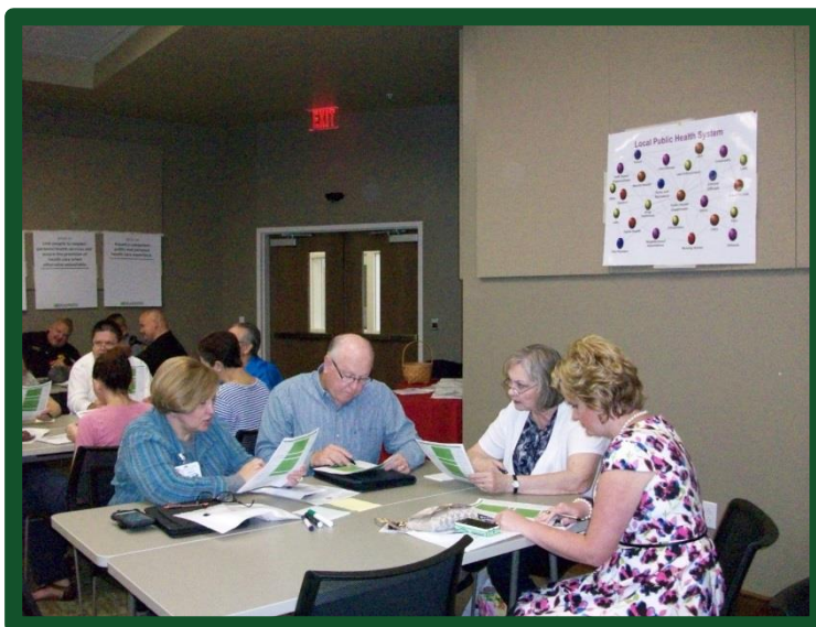
Picture 1: Groups of community partners working together at the Community Health Forum