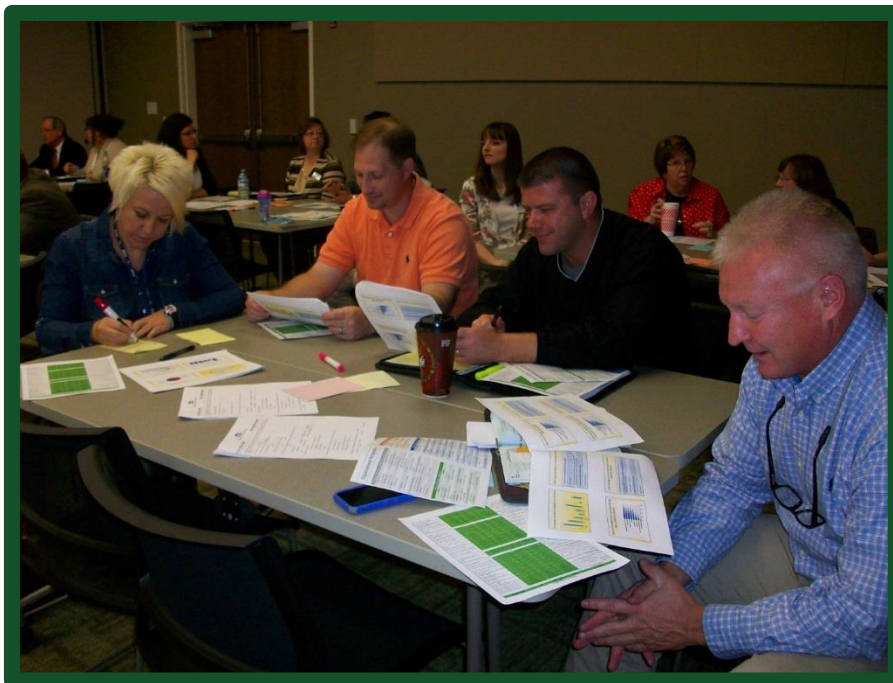
Picture 2: Groups of community partners working together at the Community Health Forum